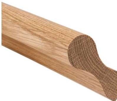
Proposed Handrail Profile in Oak

Proposed handrail line highlighted in blue, 865mm above existing floor level